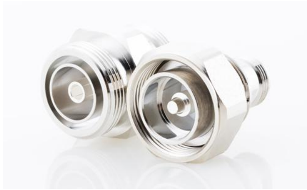
Low-PIM Adapters Selection Matrix