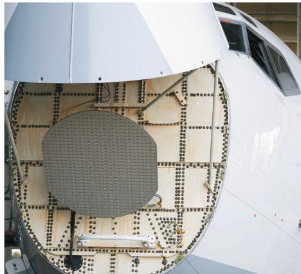
Phased array and AESA radar systems are being retrofitted into both commercial and military aircraft. They employ dozens of low noise amplifier MMICs that are relied on for receiver sensitivity and optimal signal-to-noise ratio (SNR).

Advanced applications, such as electronically steered arrays (AESAs) for military applications and phased array antennas for 5G wireless communication systems, require massive numbers of T/R modules, with each receive channel requiring an LNA.