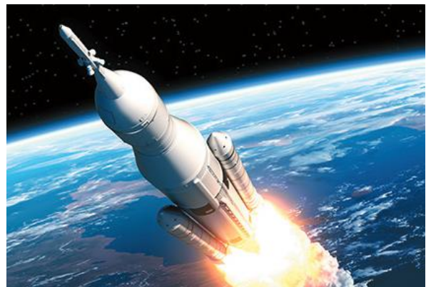
As launching satellites costs thousands to tens of thousands of dollars per kilogram, reducing the weight of a satellite system can directly influence the cost-per-bit of high-speed satellite communication services.

(bias current and bias voltage) is as efficient as possible. MMICs designed in this way also derive the benefit of lower power draw. They are also typically smaller, demonstrate better temperature performance, and provide improved SNR at lower power levels.